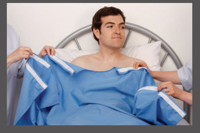
Plastic Snap Tape allows for easy access while at the same time safeguarding the wearer's dignity. The plastic snaps will not interfere with x-ray, scanner, IRM and other diagnostic exams.

Plastic Snap Tape is applied with a standard sewing process that combines the reinforcement tape and snap application in one simple operation saving both time & material.